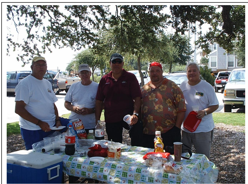
September Adopt a spot cleanup. Story on page 4.