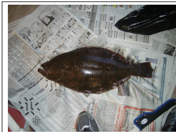
24 1/2 inch, 5.5 LBS by DOINK. Caught at Third Island Bayside near Green Buoy.